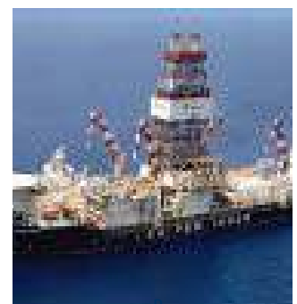
Drilling ship on location